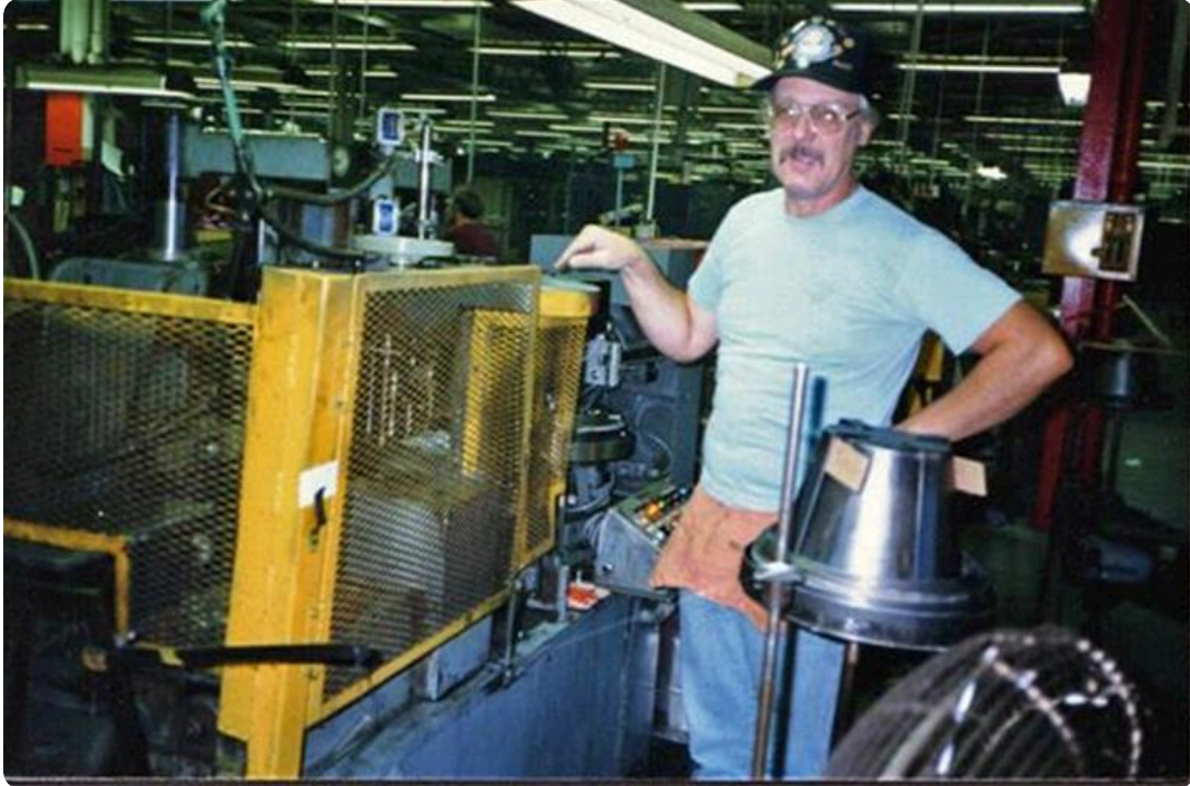
A work day at Hy-Lift